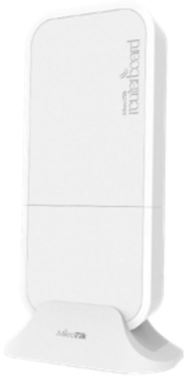
wAP LTE kit