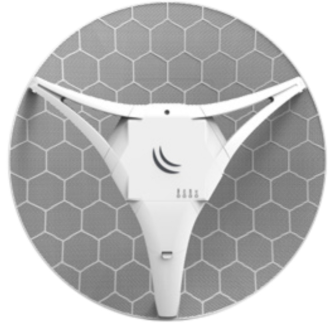
LHG LTE kit