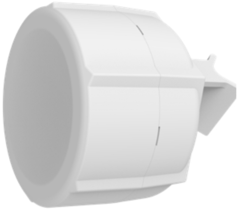
SXT LTE kit