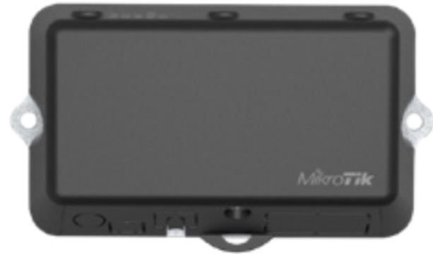
LtAP mini LTE kit